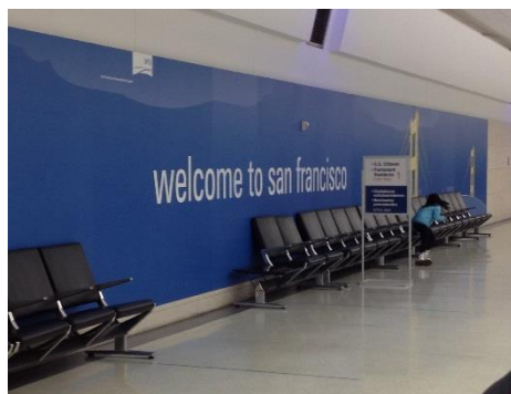
San Francisco Airport (SFO).

Due to my current research related to mixed signals, this conference was very suited