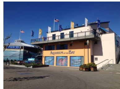
Aquarium of the Bay.