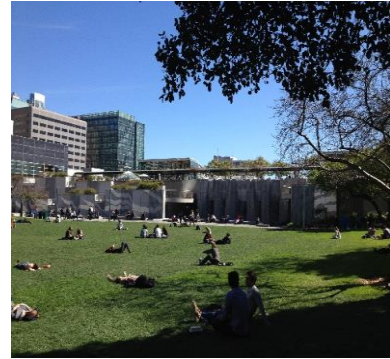
Yerba Buena Garden near Metron