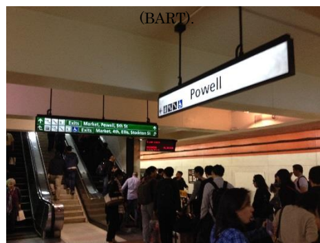
Reached at Powell Station from SFO by Bay Area Rapid Transit (BART).