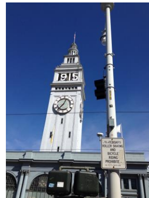
Ferry port built in 1915.