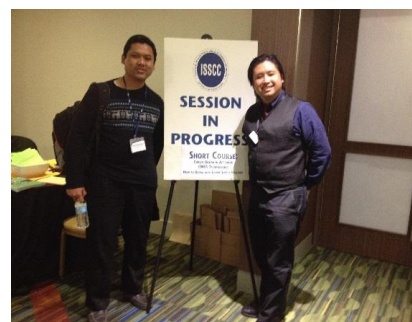
Picture taken with one of the staff at